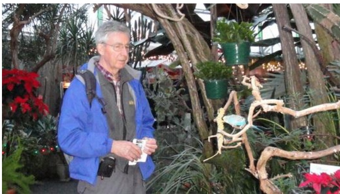
In Bloedel Conservatory on the Shaughnessy YRE