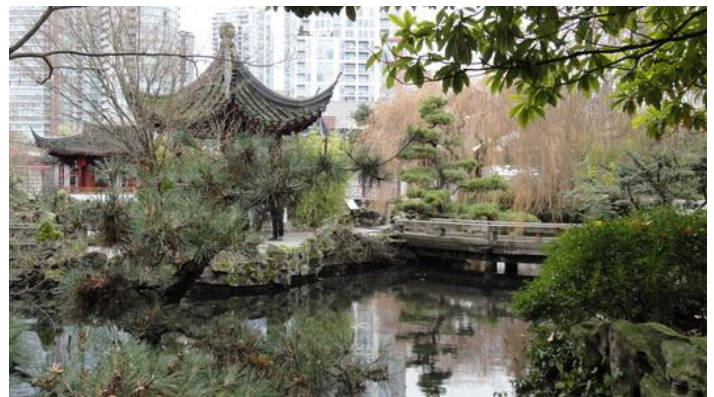
Dr Sun Yat- Sen Park on the Downtown YRE